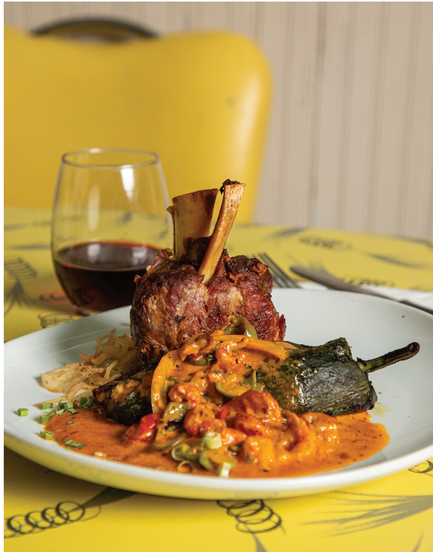
COVER: View of the Tennessee Aquarium and Riverfront Park from Walnut Street Bridge in Chattanooga, Tennessee. THIS PAGE: Pure spring comfort at Fan & Johnny's in Greenwood, Mississippi. OPPOSITE PAGE (CLOCKWISE FROM TOP LEFT): Frazier Five & Dime's Sautéed Shrimp and Creamy Polenta in Chattanooga, Tennessee; Acadian Superette in Lafayette, Louisiana; comforting local flavors in San Antonio, Texas; fun on the water in Polk County, Florida.