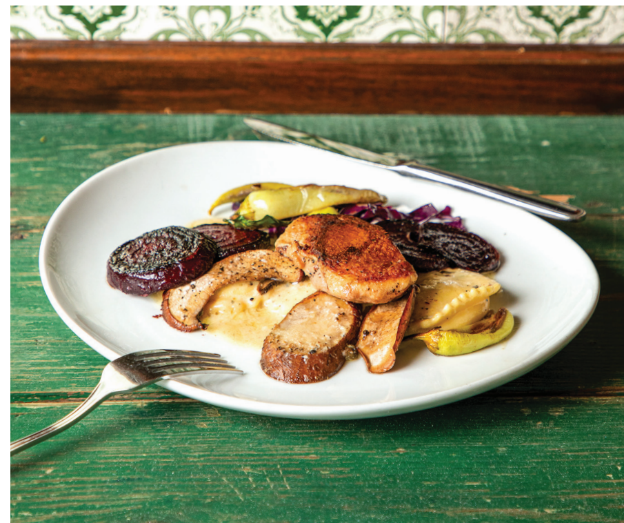
OPPOSITE PAGE (FROM LEFT): Comforting Southern flavors from Fan and Johnny's; Alluvian Old Fashioned from Giardina's. THIS PAGE (CLOCKWISE FROM TOP LEFT): Fan and Johnny's eclectic dining room; prime shopping at The Mississippi Gift Company; Giardina's at The Alluvian; roasted duck and ravioli at Fan and Johnny's.