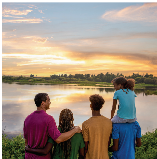
THIS PAGE (CLOCKWISE FROM TOP LEFT): Fresh brews from Grove Roots; baked treats from Born and Bread Bakehouse; scenic central Florida views; airboat excitement; merriment at Grove Roots. OPPOSITE PAGE: Gorgeous sunset views from Harborside Restaurant in Winter Haven.