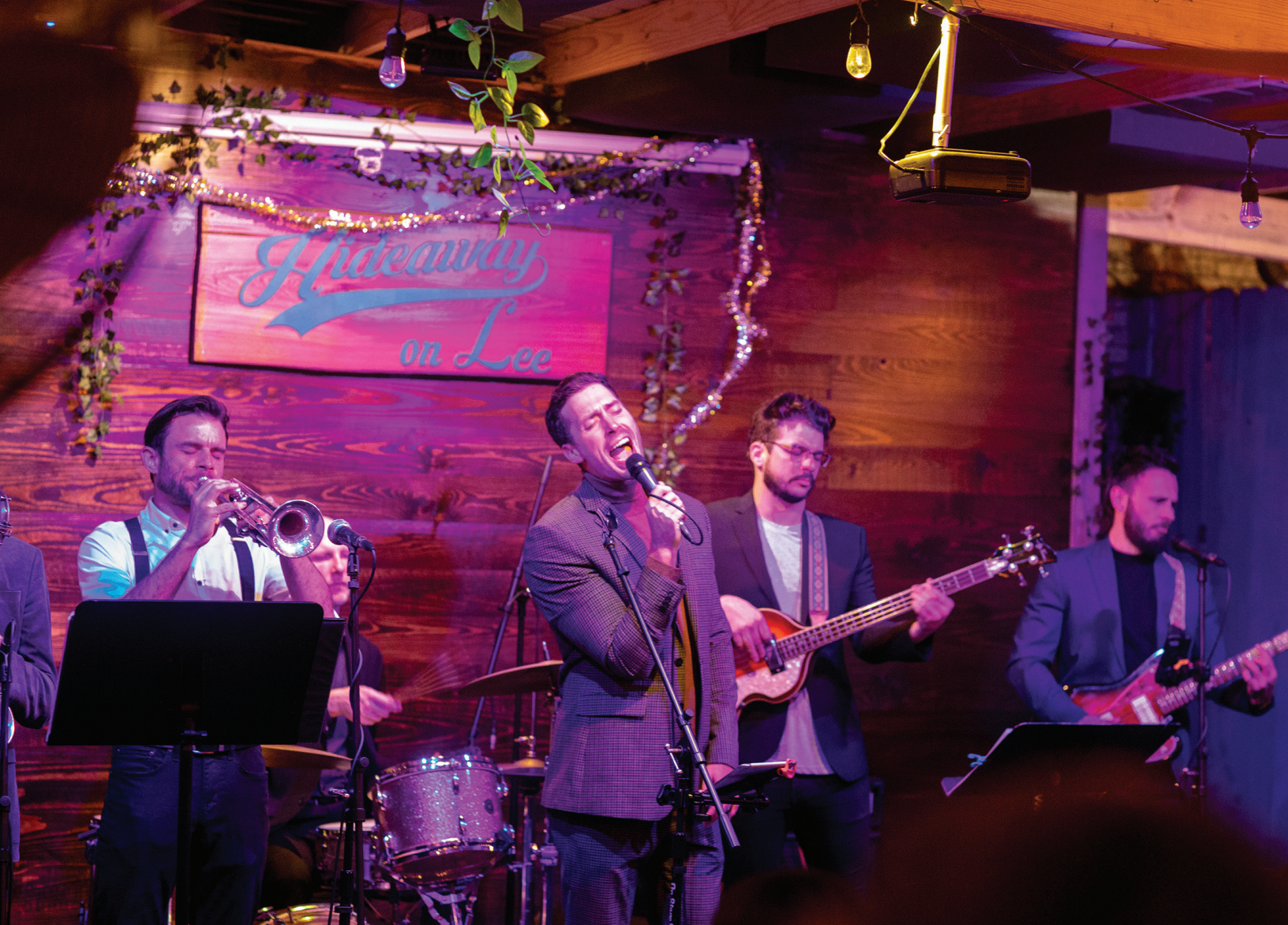
OPPOSITE PAGE: Live local music at Hideaway on Lee. THIS PAGE (CLOCKWISE FROM TOP LEFT): Acadian Superette, known for its lunch specials and house-made Cajun specialty meats; smothered sausage plate lunch special at Acadian Superette; Vestal on Jefferson Street; live music at Blue Moon Saloon; Wild Child Wine Shop; meltingly tender brisket at Acadian Superette.